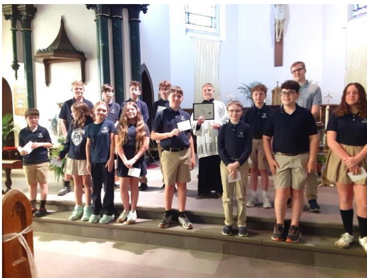
CDA Contest Winners