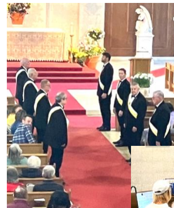
Knights of Columbus 4 th Degree Honor Guard