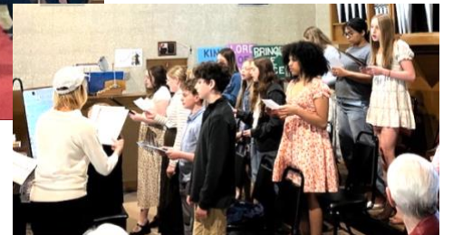
Children's Choir Sang at the Mass