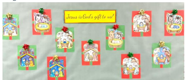
LHCS 3 rd Grade Bulletin Board

This event provides an opportunity to focus on the true reason for the season, Jesus, God's ultimate gift to us. This gift of love, salvation, and eternal life brings hope and peace to the world. The holiday's tradition of gift giving mirrors the central spiritual offering of God's Son to humanity and reminds us to be generous and share HIS love.