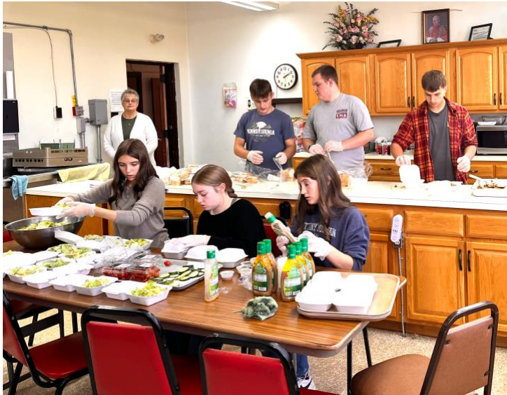
HSP Confirmation students prepare salad and bread for the meals they made for members of the community.

On November 2 nd , Holy Spirit Parish had the privilege of preparing and delivering 45 meals to members of our community. Parish volunteers teamed up with students in our religious education program who are discerning for confirmation. The students also signed greeting cards for each meal, which was greatly appreciated. Together we were able to prepare homemade lasagna, meatballs, salad, bread, and a pumpkin dessert. We filled the bags with not only a meal, but our prayers that the parishioners who received them knew that they were loved and prayed for often. We are privileged to have such a wonderful parish community, and we thank everyone who helped prepare the food, deliver the food, and pray for our community.