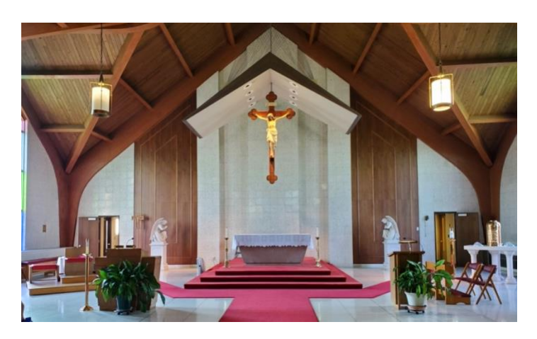
Saint Agnes Church

310 West Water Street Lock Haven, PA 17745