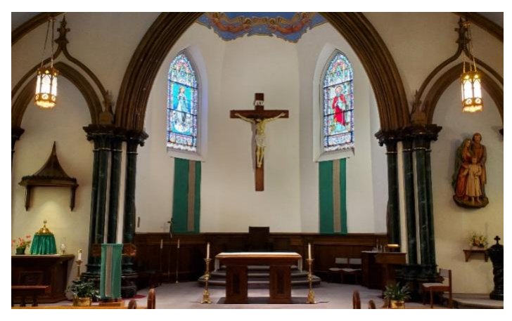
Immaculate Conception Church

310 West Water Street Lock Haven, PA 17745